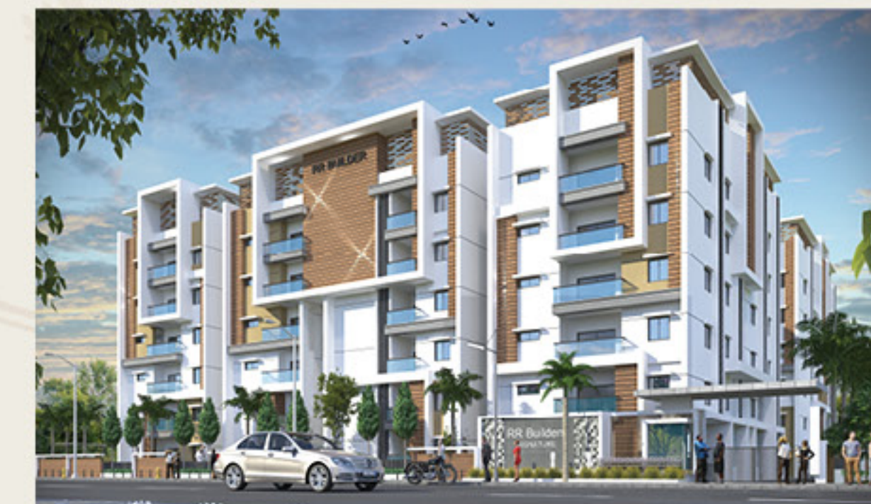
RR SIGNATURE @ Kokapet