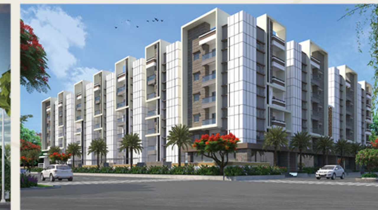
RR VILLAGE POINTE @ Alkapoor Township