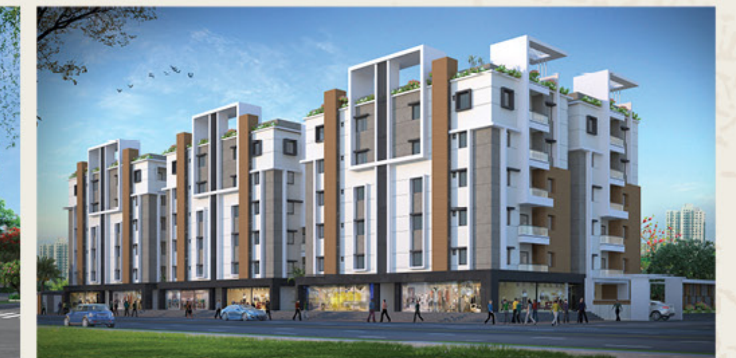
RR CENTRAL PARK @ Alkapoor Township